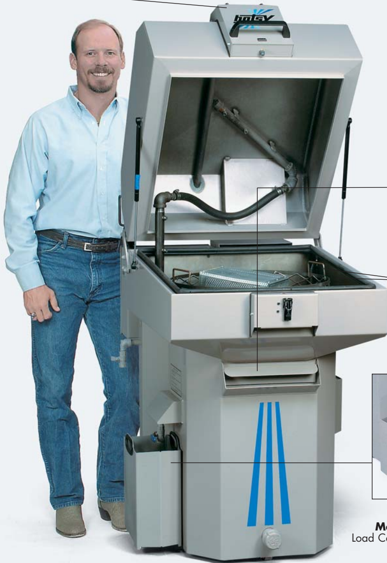
Model 7230 Load Capacity: 500 lbs.