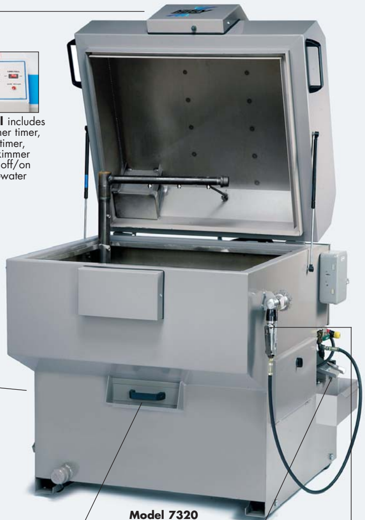
Model 7320 Load Capacity: 750 lbs. (Shown with optional power brush and 2-channel timer)

Control panel includes 60-minute wash timer, 12-hour heater timer, turntable off/on switch and low-water alert light.