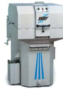
Model 7230 / S7230-1