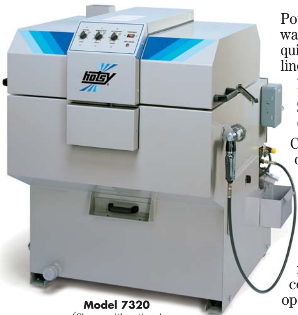
Model 7320 (Shown with optional Power Brush & Timer)

A Hotsy automatic parts washer is like a super-industrial-strength dishwasher. It combines hot water and modern detergents to give you cleaning action that's far more powerful than any solvent.