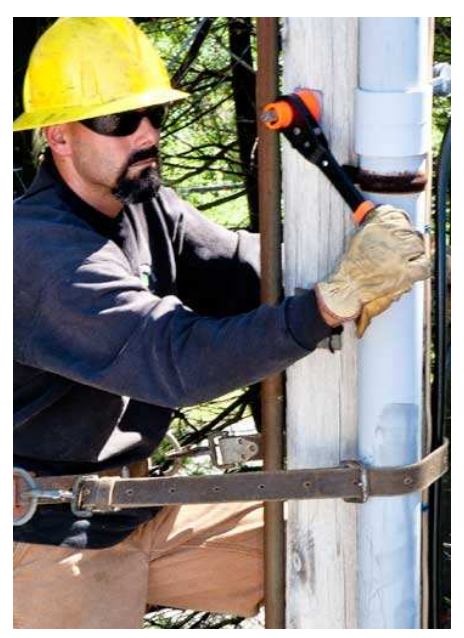
* All Lowell lineman's wrenches are "bolt-thru"